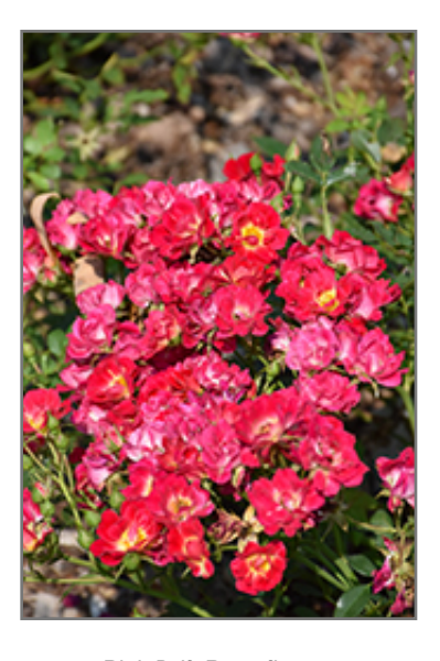
Pink Drift Rose flowers

Pink Drift Rose is recommended for the following landscape applications;