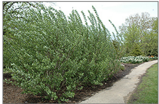
French Pussy Willow