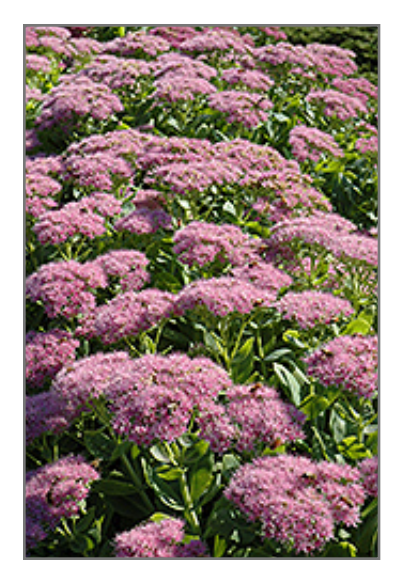
Brilliant Stonecrop flowers

Brilliant Stonecrop is recommended for the following landscape applications;