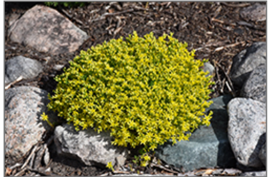
Golden Moss Stonecrop in bloom

Golden Moss Stonecrop is recommended for the following landscape applications;