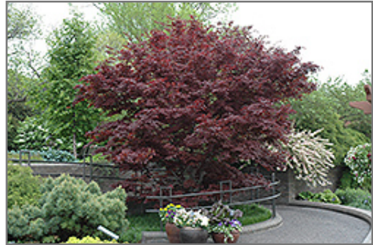
Bloodgood Japanese Maple