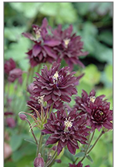
Clementine Dark Purple Columbine flowers