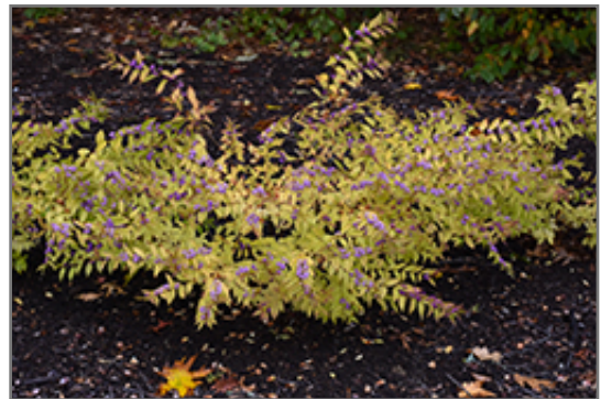
Early Amethyst Beautyberry fruit