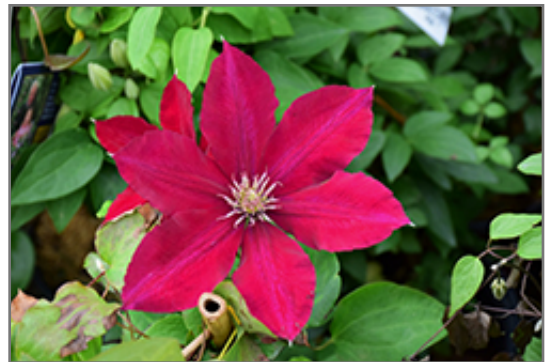
Rebecca Clematis flowers