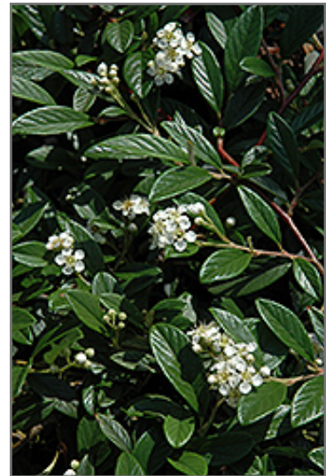
Scarlet Leader Willowleaf Cotoneaster flowers