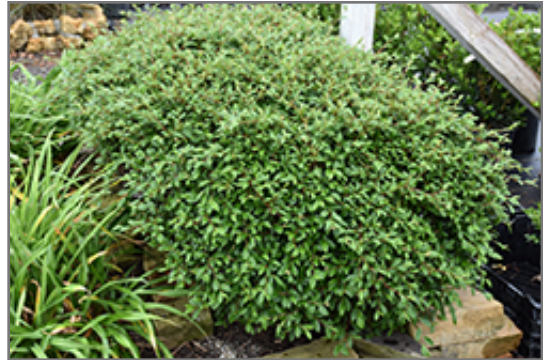
Scarlet Leader Willowleaf Cotoneaster

This shrub will require occasional maintenance and upkeep, and should not require much pruning, except when necessary, such as to remove dieback. It is a good choice for attracting birds to your yard, but is not particularly attractive to deer who tend to leave it alone in favor of tastier treats. Gardeners should be aware of the following characteristic(s) that may warrant special consideration;