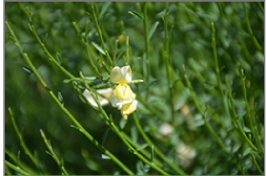
Moonlight Scotch Broom flowers

This shrub should only be grown in full sunlight. It prefers dry to average moisture levels with very well-drained soil, and will often die in standing water. It is considered to be drought-tolerant, and thus makes an ideal choice for xeriscaping or the moisture-conserving landscape. It is particular about its soil conditions, with a strong preference for clay, alkaline soils, and is able to handle environmental salt. It is highly tolerant of urban pollution and will even thrive in inner city environments. This is a selected variety of a species not originally from North America.