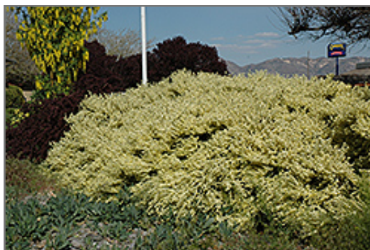
Moonlight Scotch Broom in bloom

Moonlight Scotch Broom is recommended for the following landscape applications;