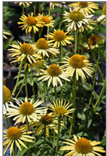
Maui Sunshine Coneflower flowers