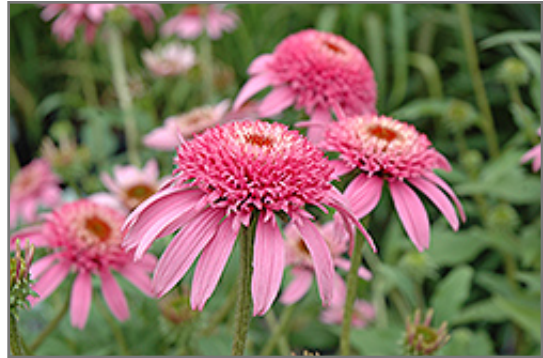
Cone-fections Pink Double Delight Coneflower flowers

Cone-fections Pink Double Delight Coneflower is recommended for the following landscape applications;