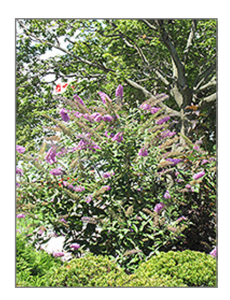
Pink Delight Butterfly Bush in bloom