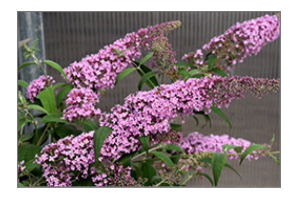
Pink Delight Butterfly Bush flowers

Pink Delight Butterfly Bush is recommended for the following landscape applications;