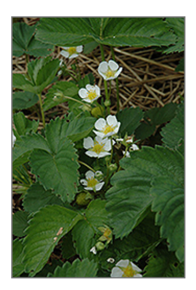
Surecrop Strawberry flowers