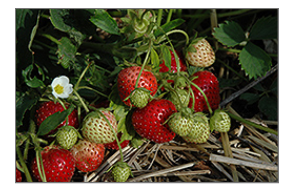
Surecrop Strawberry fruit

Surecrop Strawberry features dainty white daisy flowers with yellow eyes along the stems in mid spring. Its tomentose round compound leaves remain green in color throughout the season. It features an abundance of magnificent cherry red berries from late spring to early summer.