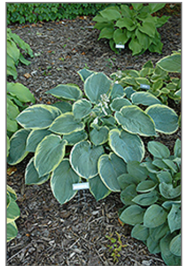
American Halo Hosta