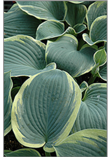
American Halo Hosta foliage

American Halo Hosta is recommended for the following landscape applications;