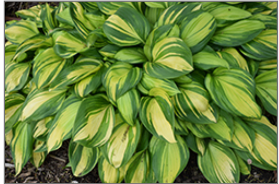
Rainbow's End Hosta