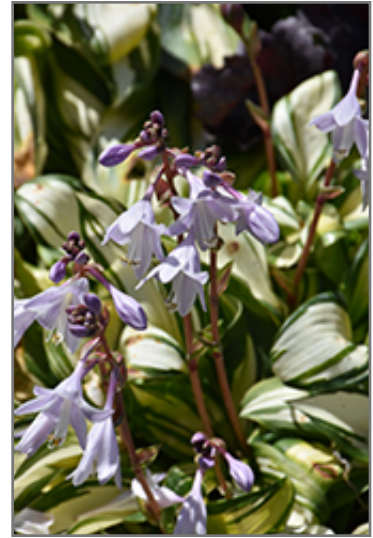
Rainbow's End Hosta flowers

This plant does best in partial shade to shade. It prefers to grow in average to moist conditions, and shouldn't be allowed to dry out. It is not particular as to soil type or pH. It is somewhat tolerant of urban pollution. This particular variety is an interspecific hybrid. It can be propagated by division; however, as a cultivated variety, be aware that it may be subject to certain restrictions or prohibitions on propagation.