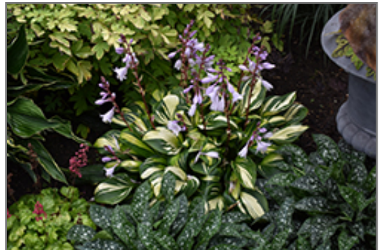
Rainbow's End Hosta in bloom