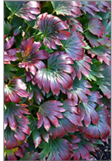
Crimson Fans Mukdenia foliage

Crimson Fans Mukdenia is recommended for the following landscape applications;