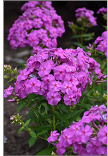
Flame Lilac Garden Phlox flowers

Flame Lilac Garden Phlox is recommended for the following landscape applications;