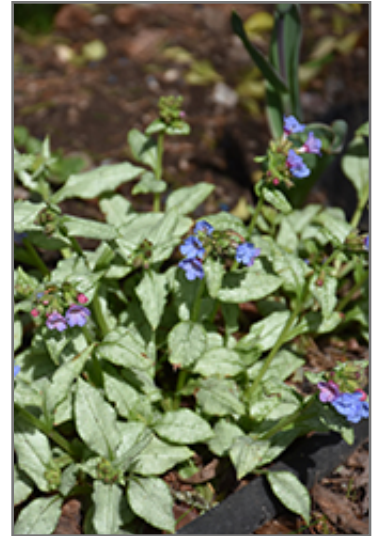
Moonshine Lungwort in bloom

This is a relatively low maintenance plant, and should be cut back in late fall in preparation for winter. It is a good choice for attracting hummingbirds to your yard, but is not particularly attractive to deer who tend to leave it alone in favor of tastier treats. It has no significant negative characteristics.