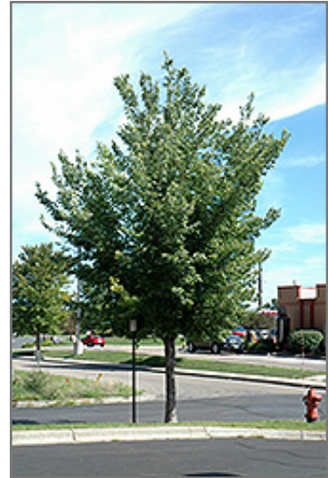
Common Hackberry