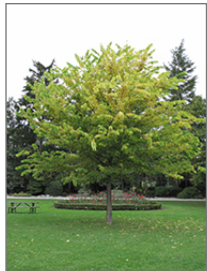
Common Hackberry in fall