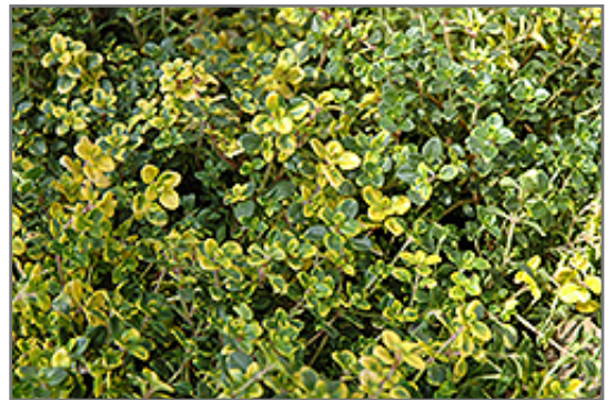
Doone Valley Thyme