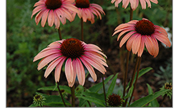
Big Sky Summer Sky Coneflower flowers

Big Sky Summer Sky Coneflower has masses of beautiful lightly-scented rose daisy flowers with dark red eyes and salmon tips at the ends of the stems from mid summer to mid fall, which are most effective when planted in groupings. The flowers are excellent for cutting. Its pointy leaves remain green in color throughout the season.