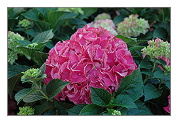
Forever And Ever Red Hydrangea flowers