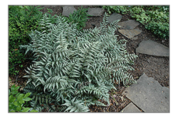
Japanese Painted Fern

Japanese Painted Fern is primarily valued in the garden for its cascading habit of growth. Its attractive ferny bipinnately compound leaves remain grayish green in color with prominent silver tips throughout the season. The dark red stems are very colorful and add to the overall interest of the plant.